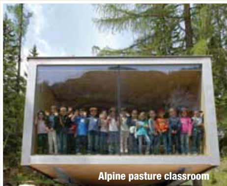
Alpine pasture classroom