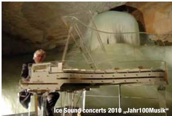
Ice Sound concerts 2010 „Jahr100Musik“