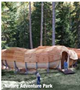
Nature Adventure Park