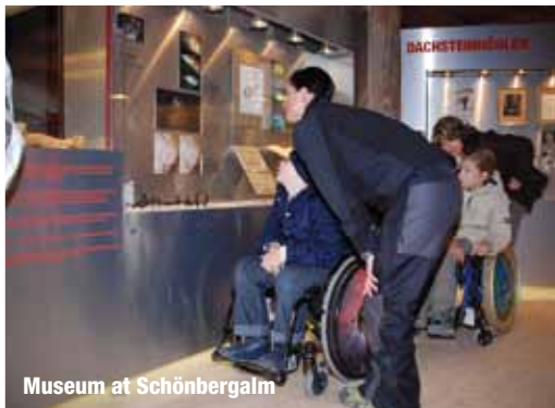
Museum at Schönbergalm