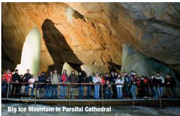
Big Ice Mountain in Parsifal Cathedral