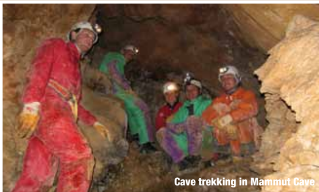
Cave trekking in Mammut Cave