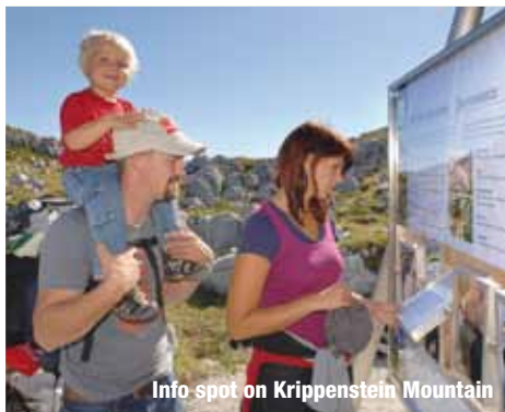
Info spot on Krippenstein Mountain